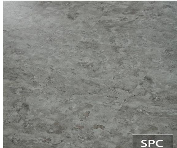
Mottled Grey stone tile