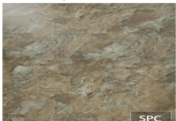
Travertine Stone Tile